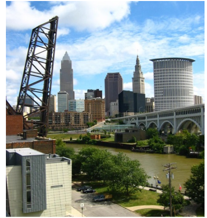
View of Downtown Cleveland

Cleveland and northeast Ohio are rich with cultural, educational, culinary, and recreational opportunities. VA Northeast Ohio Healthcare System is located in University Circle , at edge of the Rockefeller Cultural Gardens , along with such esteemed neighbors as Cleveland's renowned and newly expanded Museum of Art , Cleveland Botanical Gardens , Museum of Natural History , Western Reserve Historical Society , Case Western Reserve University, Cleveland Institute of Art, and Cleveland Institute of Music. Kent State University, Cleveland State University and the University of Akron are major educational institutions within easy driving distance.