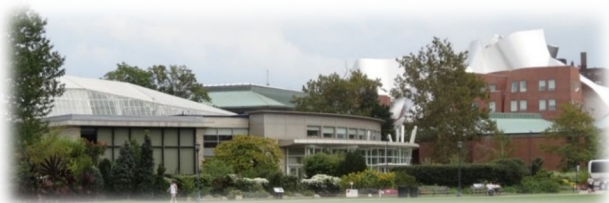
View of Cleveland Botanical Garden and Case Western Reserve at University Circle

wide range of accommodations, including apartments, condominiums, and single-family dwellings. Many trainees have been pleasantly surprised by lower housing costs and living expenses than are found in many metropolitan areas, and have remained in the community to begin their professional careers.