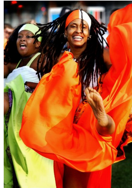
Dance Afrika performs the Samba at the Children's Games.